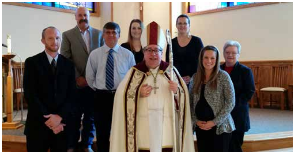
Our Catechumens and Candidates attended the Bishop's Rite of Election & Call to Continuing Conversion on February 14th.

Daylight Savings Time begins next Sunday, March 8 th . Don't forget to "spring" your clocks forward 1 hour!